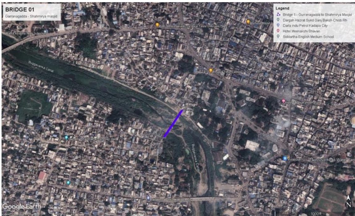
Work No :02: Construction of 7 m wide Pedestrian Bridge from Thalusamma Hospital to Ravindra Nagar (65.51m)

Bridge Location (HLB): Coordinates: 14°28'22.74"N, 78°49'14.17"E on Google Earth (Orange line marked in the below image)